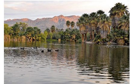
Aqua Caliente Park, Tucson AZ

On July 24th at 8:00 am, nine Tucson Grandmothers met in circle at the big lake in Aqua Caliente Park, Tucson AZ. Our intention was to create ceremony and add our energy for healing the waters to the other circles, including the Gulf Coast Council, who were doing the same that day. Many grandmothers from around the country and Canada who could not be present physically were present in spirit as we sat in meditation. We were joined by our feathered friends chirping, (cont'd page 3)