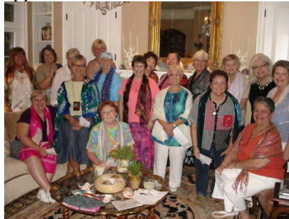
Alabama Grandmothers 2010 attending Water Ceremony

Grandmothers would like to extend its heartfelt thanks to all those who joined us in spirit, from all across the country, to send positive energy to help heal our beloved Gulf. Those of you that informed us of your intentions were acknowledged in an announcement prior to the water ceremony. All efforts to support life in and around the Gulf is always welcomed and greatly appreciated.